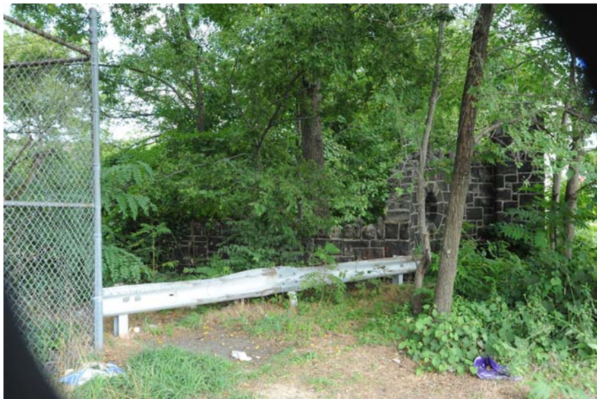
North and south entrance gates, looking from Grant Avenue, and remaining half of north gate, 2014.