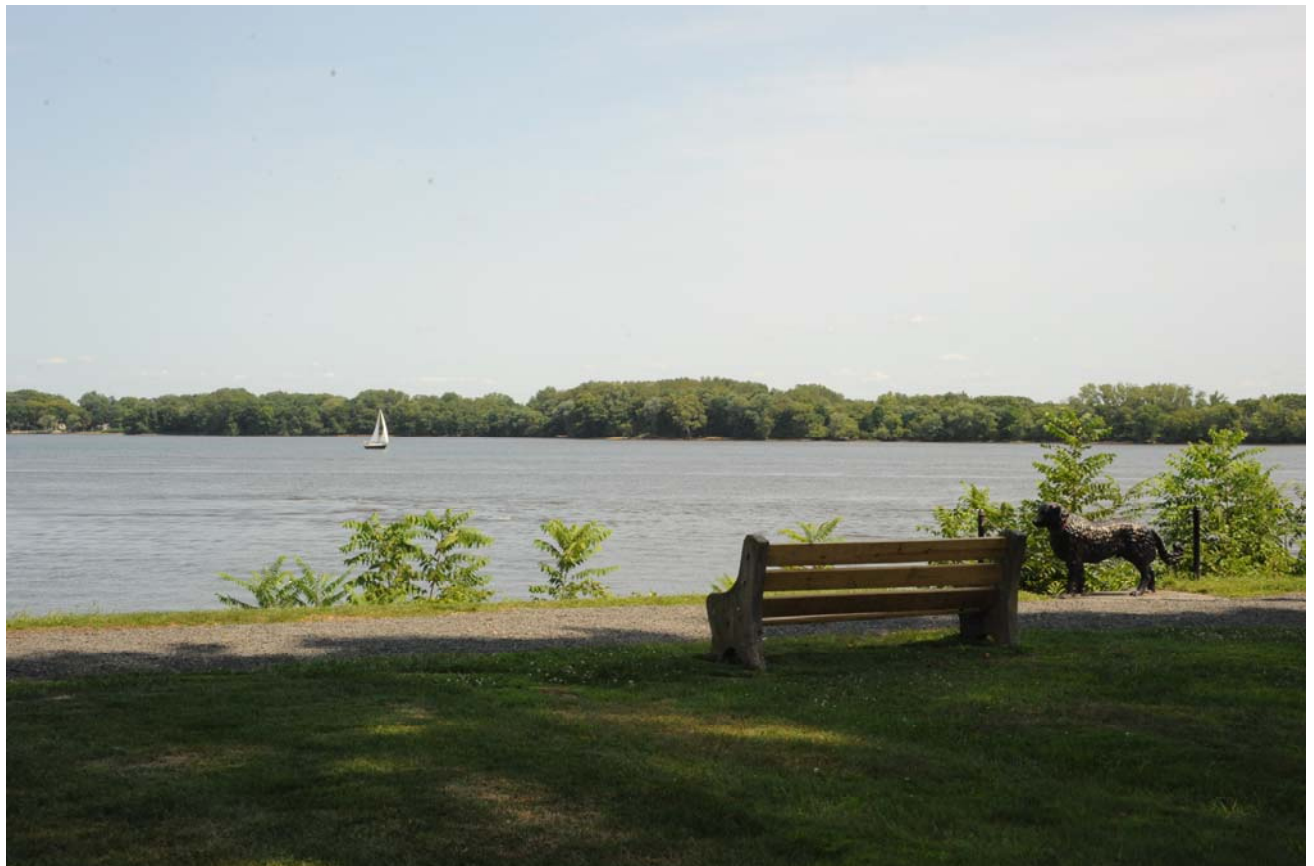
Gazebo, event tent, and Little Ugly statue, 2014.