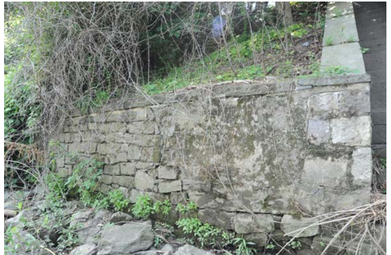
Entrance stairs from the Delaware River, and retaining wall, 2013 and 2014.