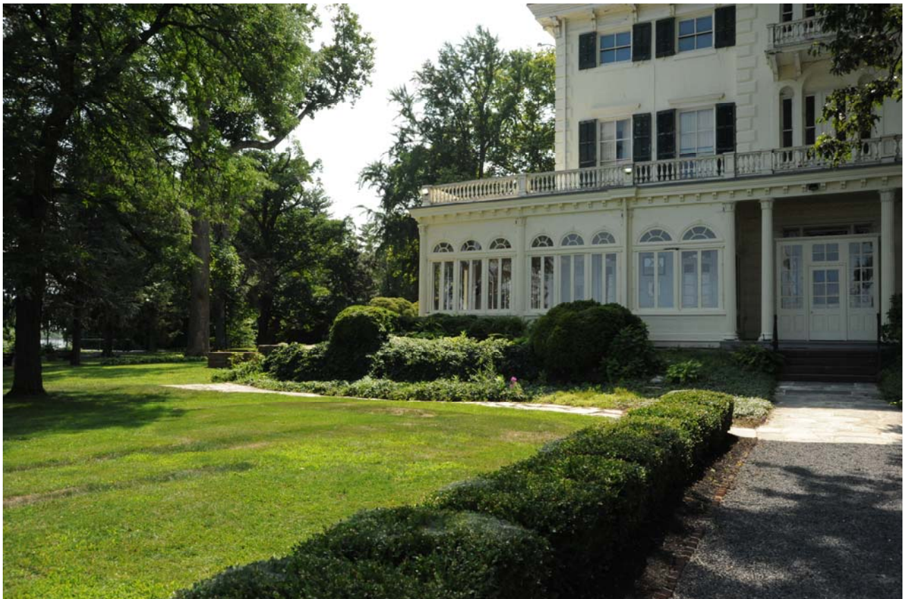
Main house and adjacent areas, 2014.