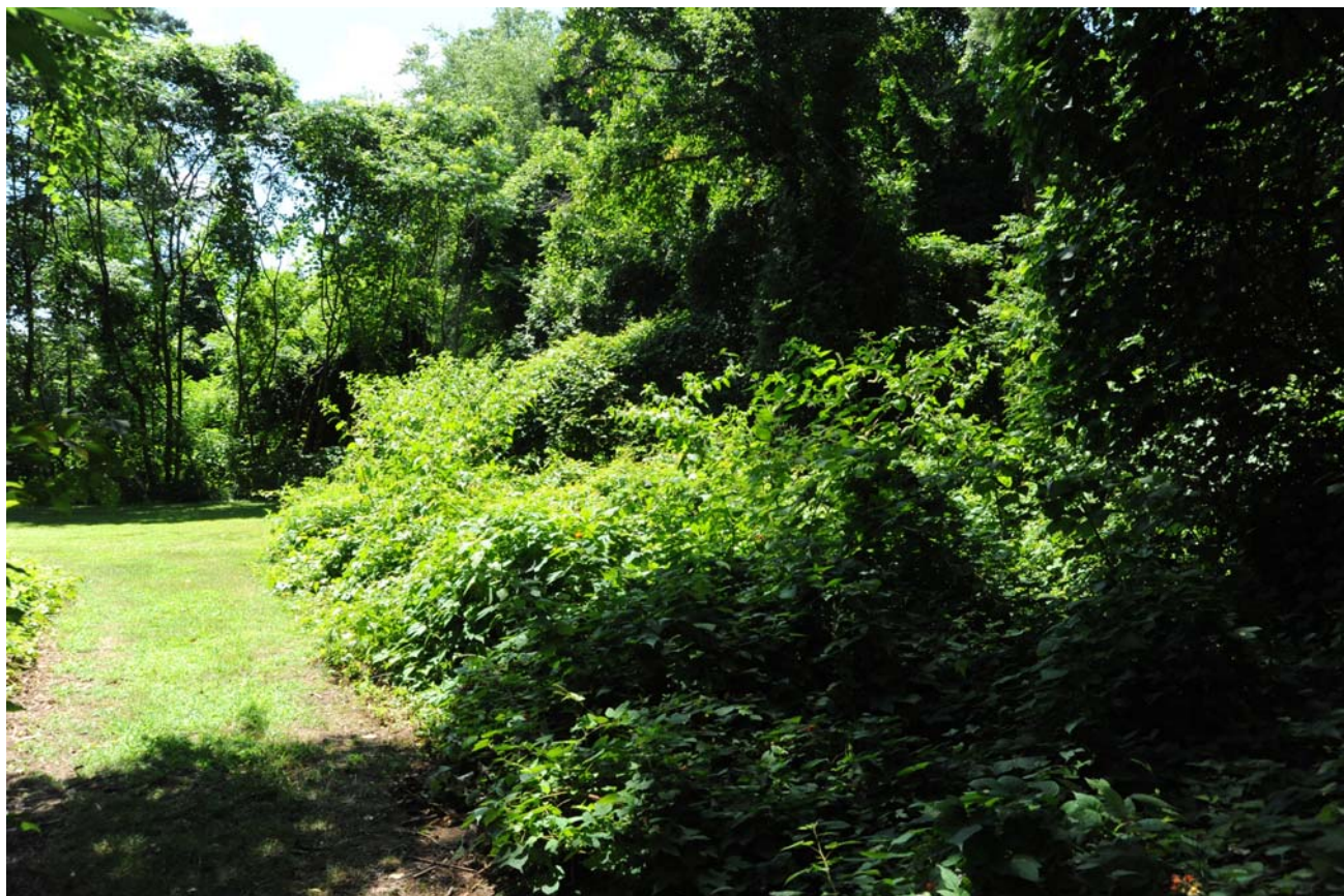
South grove, 2014.