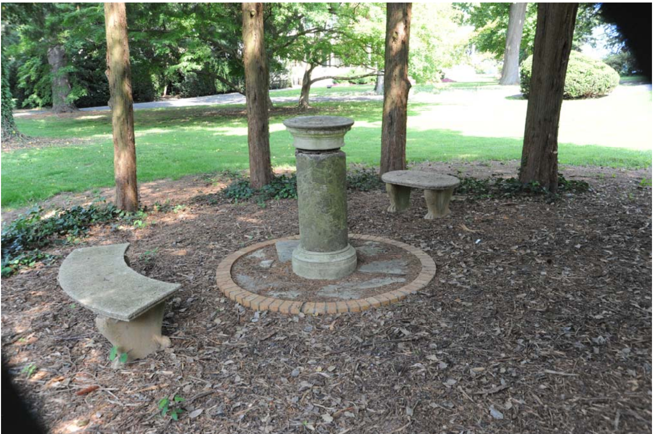
Remains of garden house terrace and historic pedestal and benches, 2014.