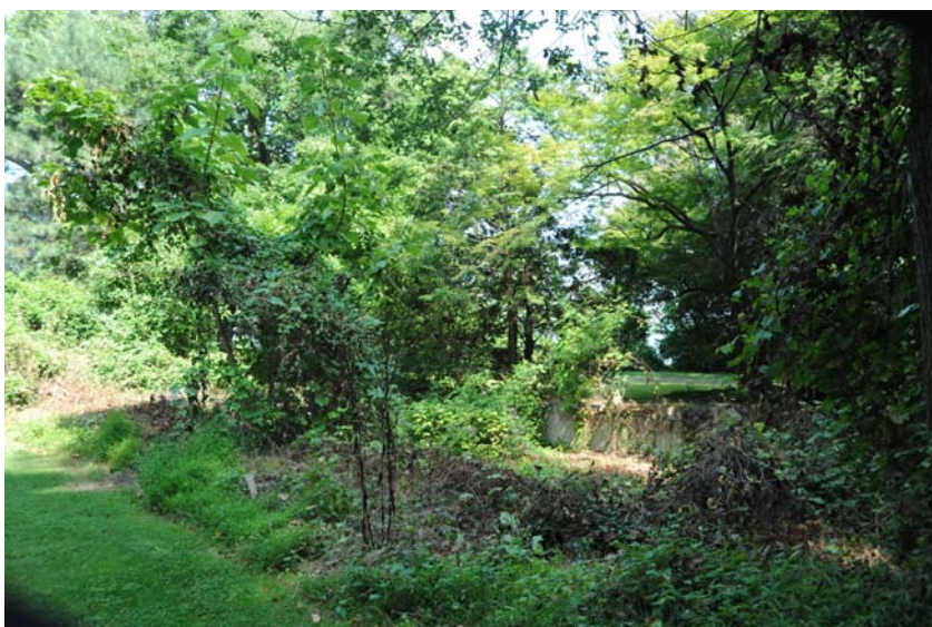
Details, woodland walk and lily pond, 2014.