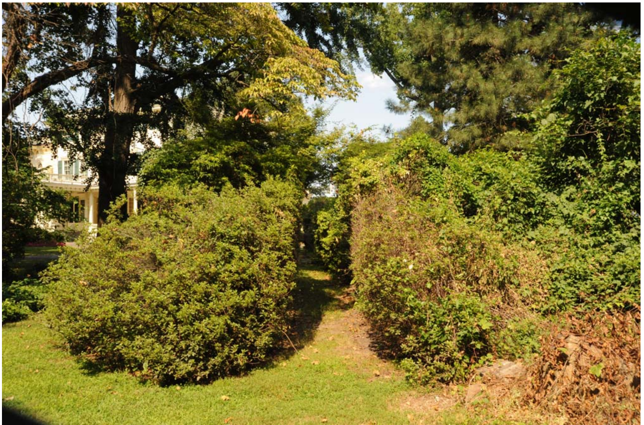
North and south entrance gates, looking southeast from Grant Avenue, 2014.