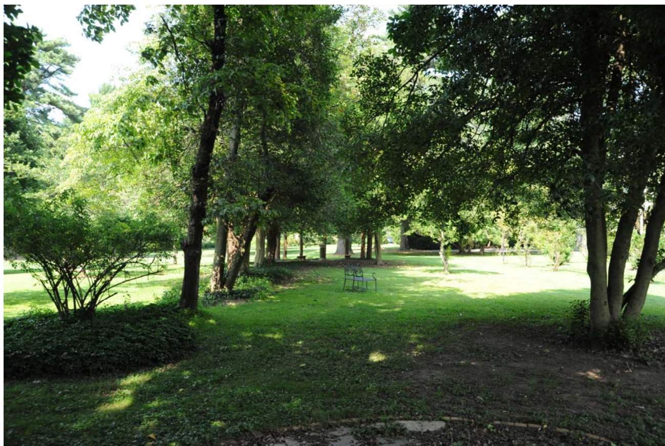
Rose garden and dogwood allée, 2014.