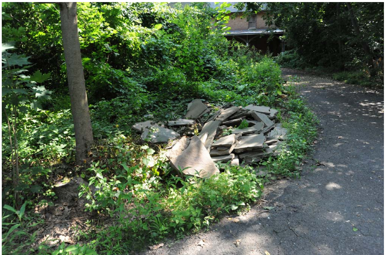
South grove, 2014.