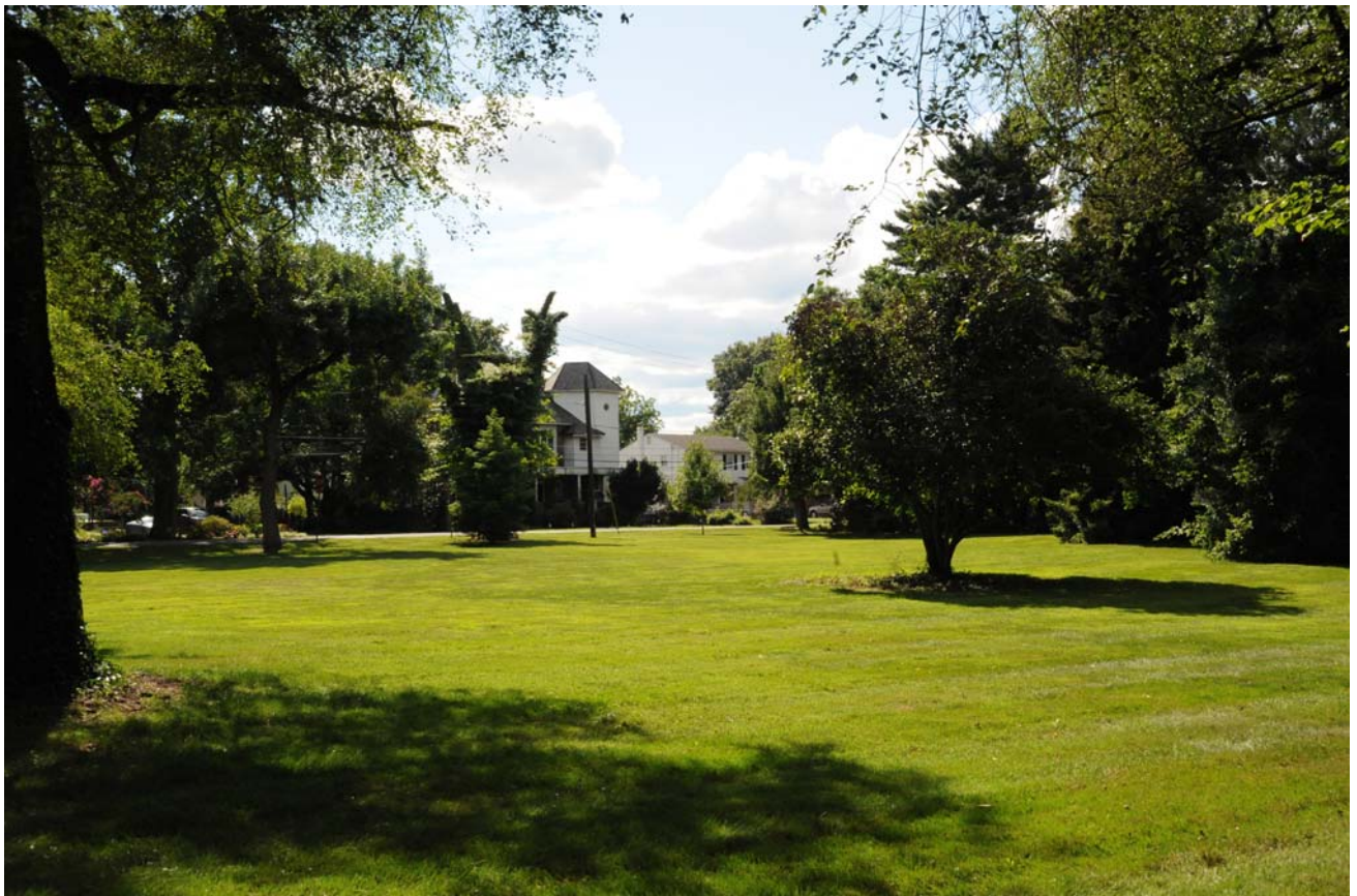
English park area, 2014.