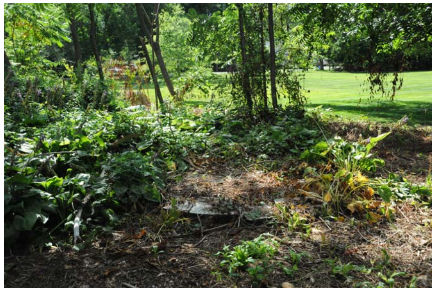
English park area details, 2014.