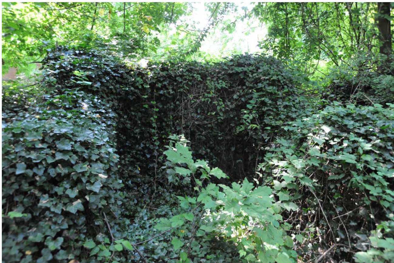
Tennis court area and decorative niche or fountain, 2014.