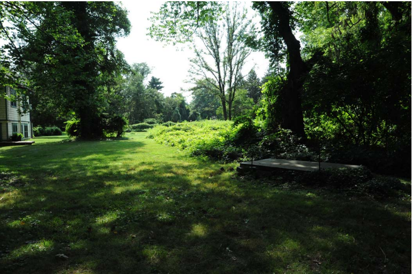
Service zone, showing remaining gate or arbor, cold frame base, and Maclester family crypt, 2013 and 2014.