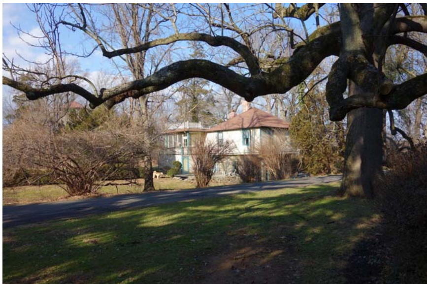
Cottage and former vegetable garden area with observation tower, 2013, 2014. Photographs: E. Cooperman.