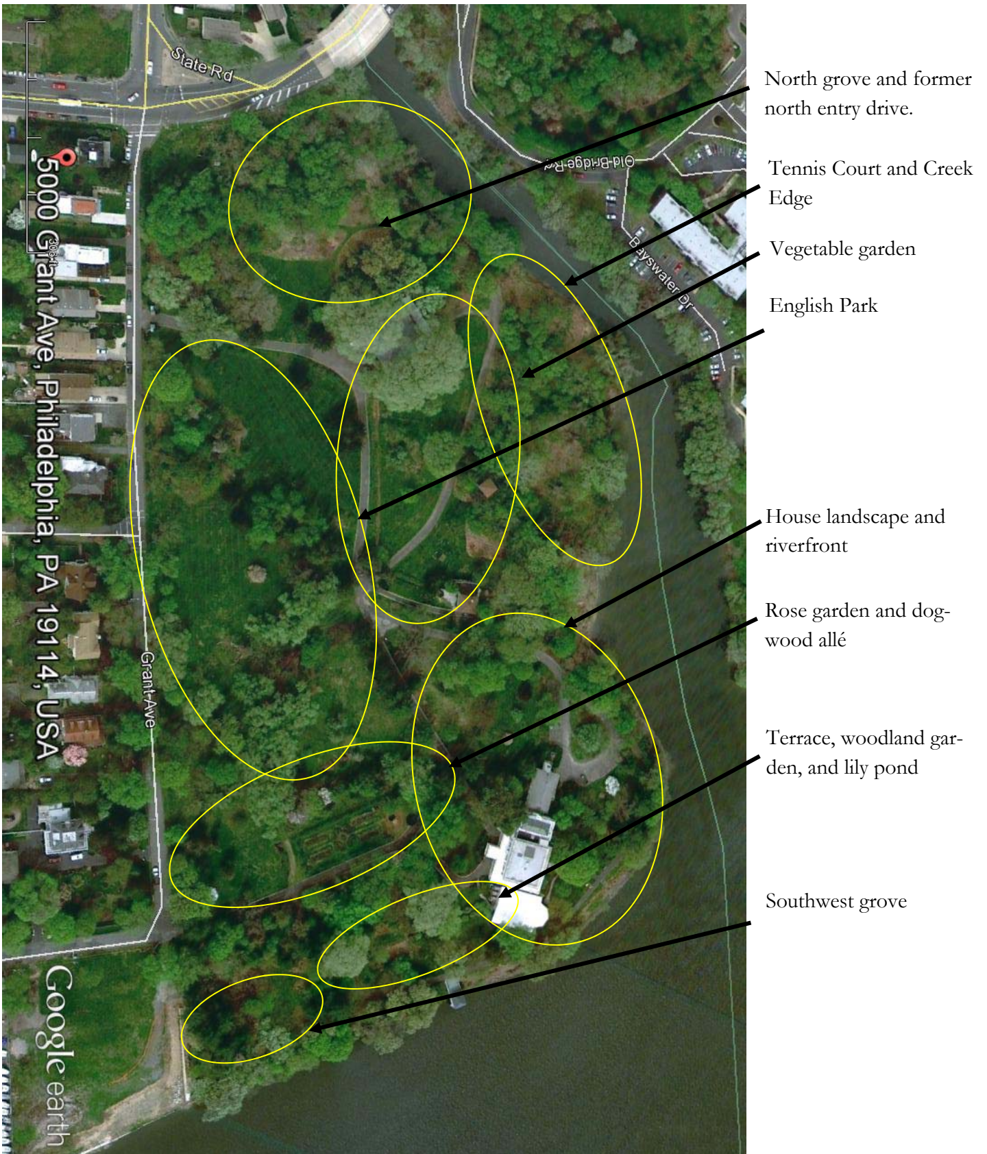
Principal landscape areas, Glen Foerd.